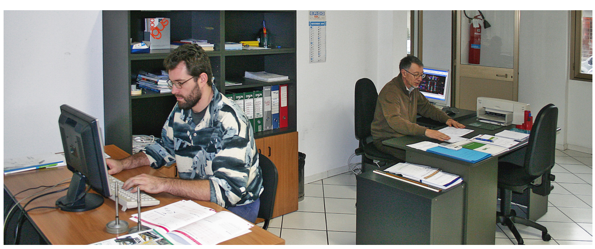
From the project to the idea and the finished product, Meccanica Besnatese can assist customers along the whole development process, from design to final testing.